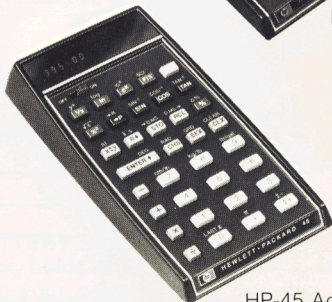
HP-45 Advanced Scientific Pocket Calculator