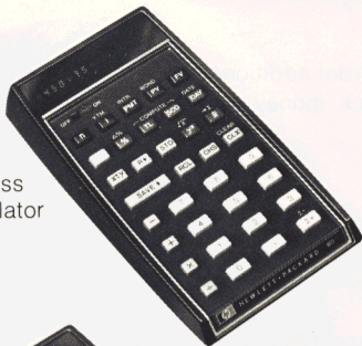
HP-80 Business Pocket Calculator